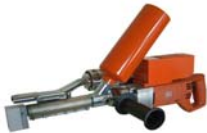
Type HSK25 DE- G Granulat