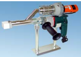
Type HSK12 Type HSK12 E