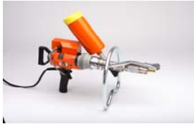
Type HSK60 DE- G Granulat