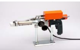
Type HSK12 D Type HSK12 DE