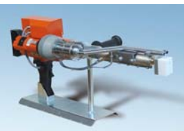
Type HSK50 D Type HSK50 DE