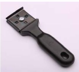
Hand scraper 38mm