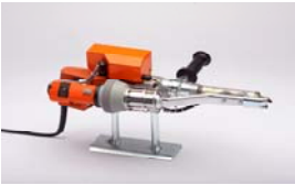
Type HSK23 D Type HSK23 DE