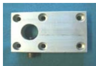
Aluminium base plate Typ 1 Aluminium base plate Typ 2 Aluminium base plate Typ 3