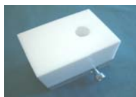
Extruder nozzle blank type 1 Extruder nozzle blank type 2 Extruder nozzle blank type 3