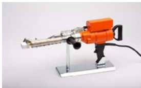
Type HSK60 D Type HSK60 DE