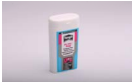
Plastic cleaner for weld preparation