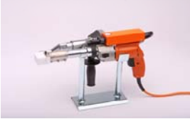
Type HSK08 DE compact